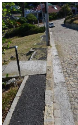
BEFORE AND AFTER – DUIGNAM ROAD